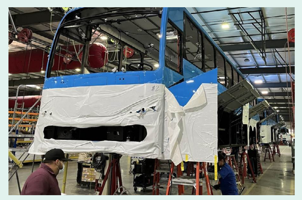
Pictured here: One of the new electric buses getting painted and ready to roll soon.

Ventura County Transportation Commission (VCTC) will soon be rolling out five new electric buses in partnership with Santa Barbara County. The buses are fully electric and part of VCTC's commitment to clean air efforts.